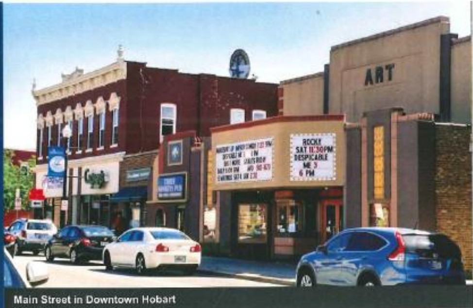
Main Street in Downtown Hobart