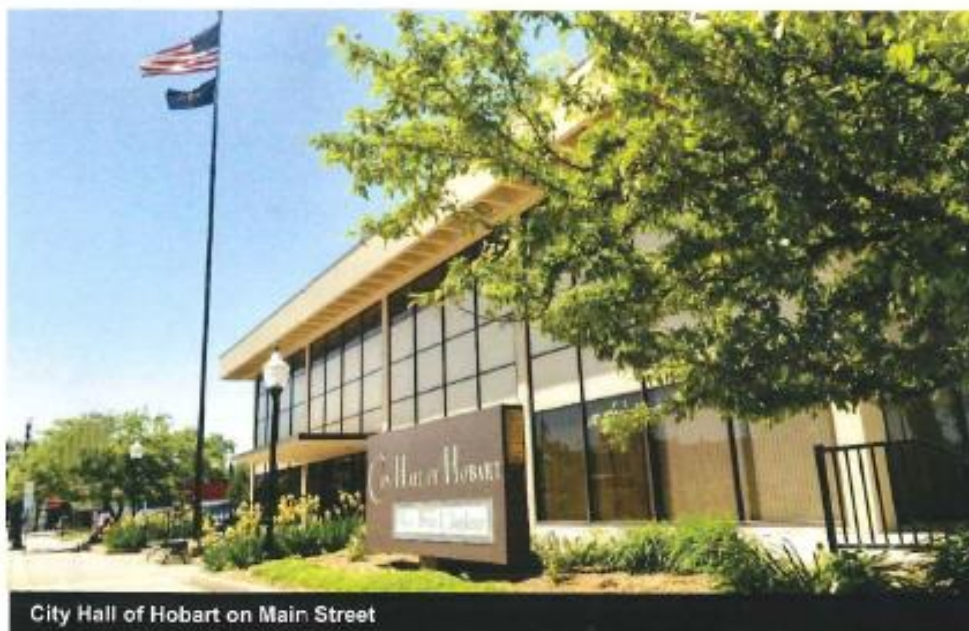
City Hall of Hobart on Main Street