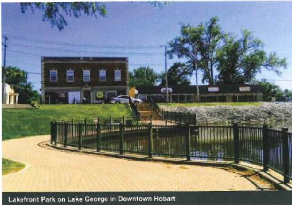
Lakefront Park on Lake George in Downtown Hobart